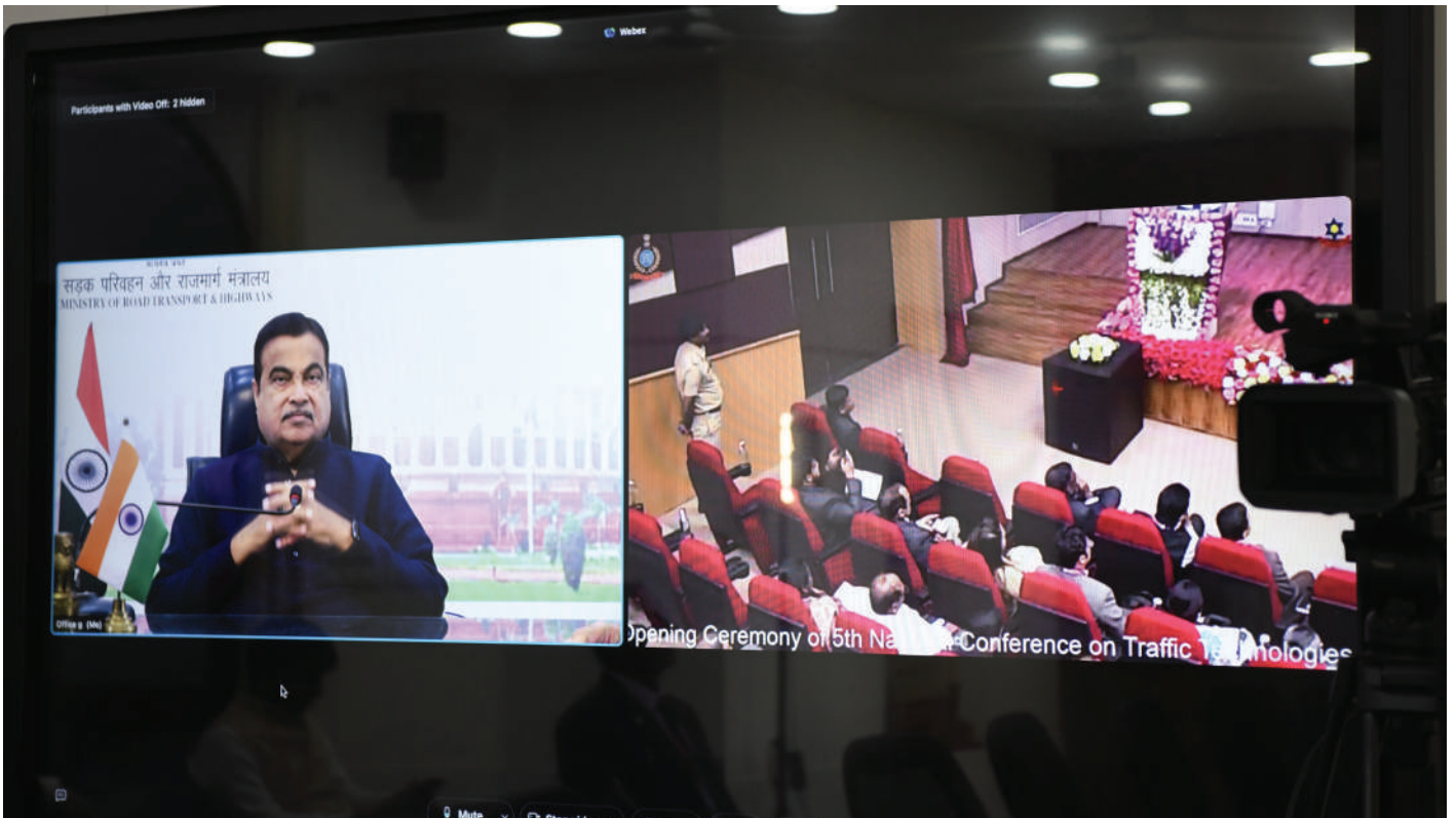
माननीय केन्द्रीय सड़क परिवहन एवं राजमार्ग मंत्री, श्री नितिन गडकरी जी मुख्य अतिथि के रूप में प्रतिभागियों को वर्चुअली संबोधित करते हुए।