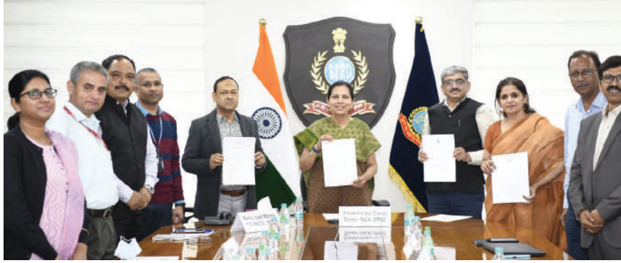
Memorandum of Understanding (MoU) Signing Ceremony

A Memorandum of Understanding (MoU) was signed between the BPR&D and the National Council of Applied Economic Research (NCAER), New Delhi, on 02.03.2023 to conduct the first "All India Citizens Survey of Police Services" (AICSPS). ●