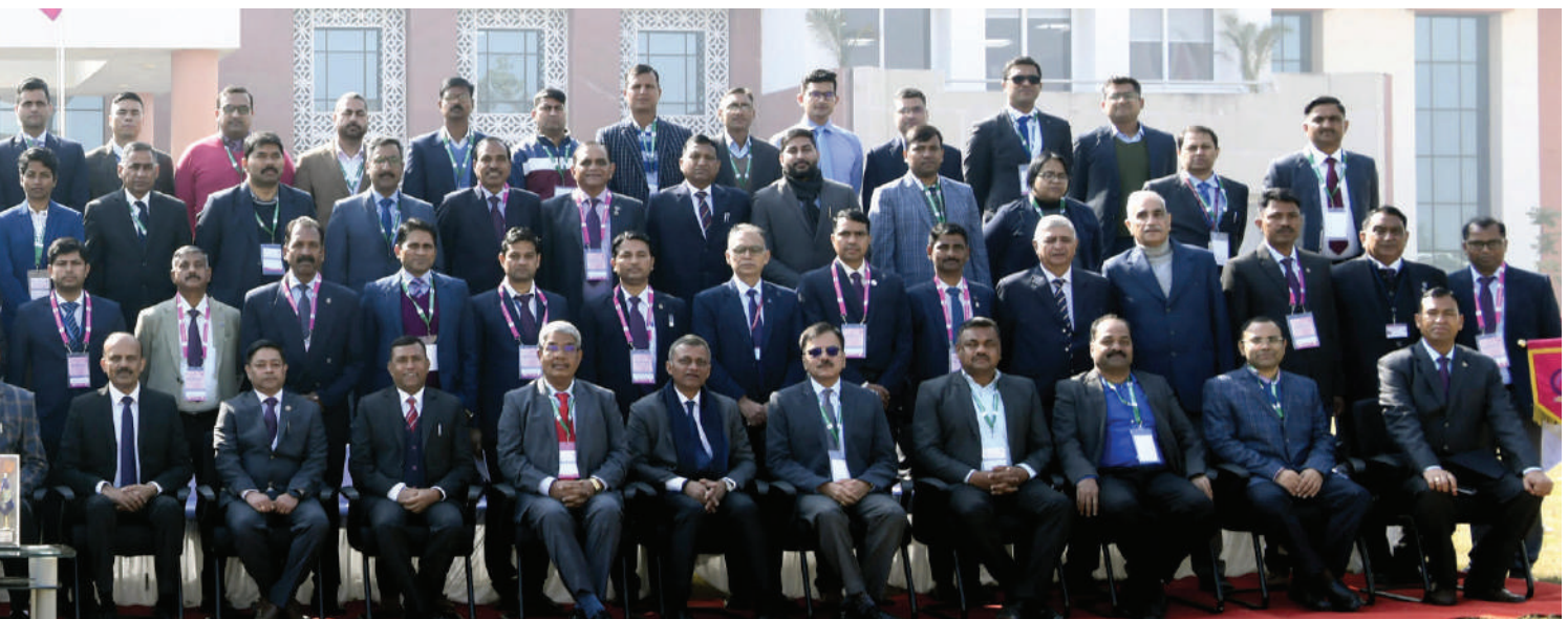
Group photograph of participants during 3rd National Conference of Heads of Police Investigation Agencies