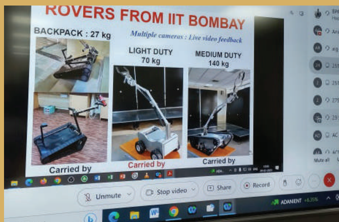
Slide from one of the Presentation