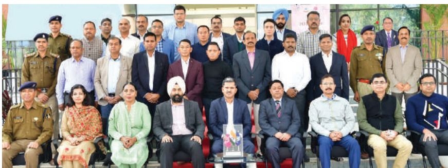
OSD, MEA with participants at CDTI, Jaipur

A 04-day Training of Trainers (ToT) Course on "G-20 Security related Issues" was conducted at CDTI, Jaipur. The training session was inaugurated by OSD, MEA, Colonel Neil Katoch. Overview of the G-20, Strategies, Multilateral Platform and other important security related topics were covered. ●