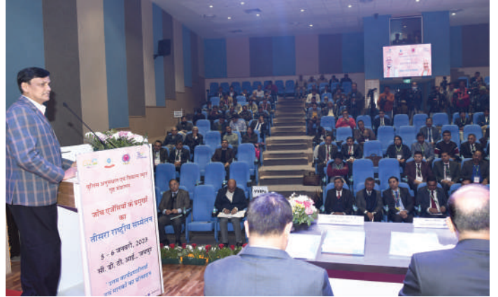
माननीय केन्द्रीय गृह राज्यमंत्री, श्री नित्यानंद राय जी जाँच एजेंसियों के प्रमुखों के तीसरे राष्ट्रीय सम्मेलन में भाषण देते हुए