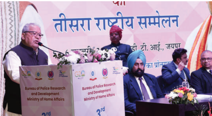
माननीय राज्यपाल, राजस्थान, श्री कलराज मिश्र जी जांच एजेंसियों के प्रमुखों को संबोधित करते हुए