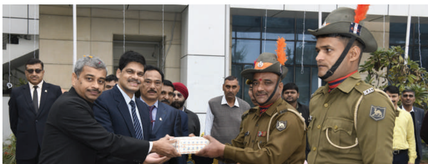
Sweets distribution to the guards during 74th Republic Day

74th Republic Day was celebrated at BPR&D Head Quarters and its outlying units. The National Flag was unfurled on this occasion. Sweets were also distributed to all the staff members. ●