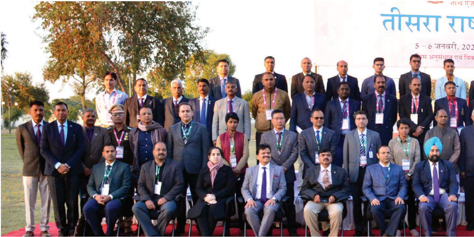
Group Photograph with Hon'ble Governor, Rajasthan, Sh. Kalraj Mishra Ji, and other officials.

The 3rd National Conference of Heads of Police Investigation Agencies was held at CDTI, Jaipur from