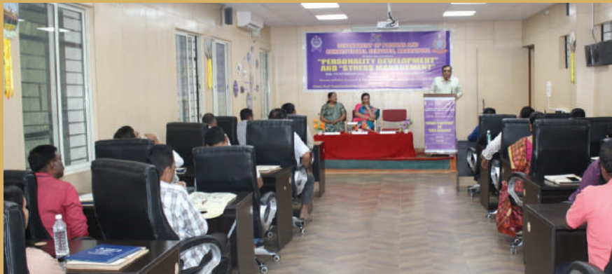
Workshop on "Personality Development and Stress Management"