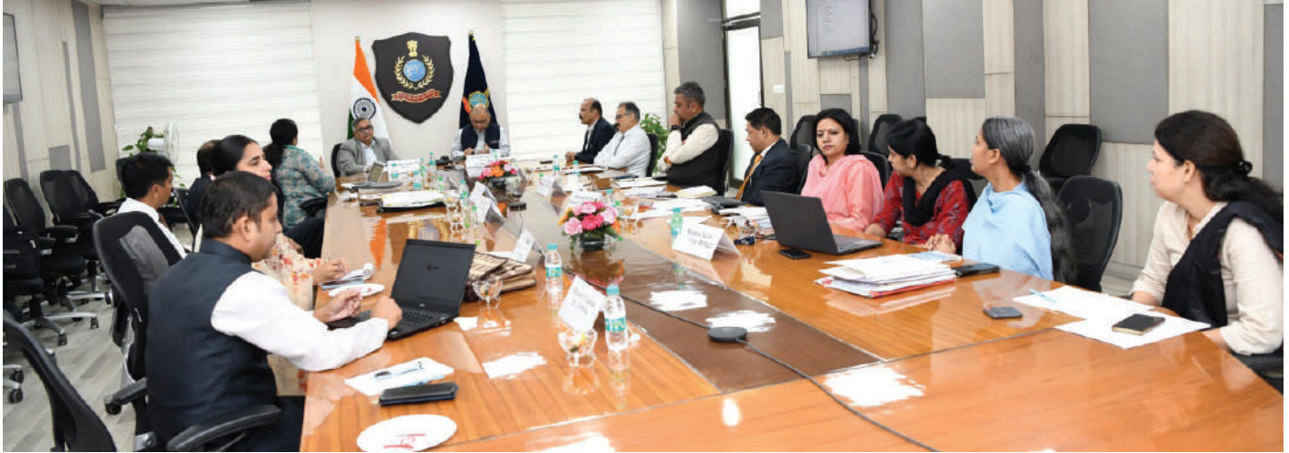
महानिदेशक, बीपीआरएंडडी, मुख्यालय में पुलिस उपाधीक्षक / उपनिरीक्षक / कांस्टेबल के पाठ्यक्रम के मानकीकरण पर कार्यशाला को संबोधित करते हुए