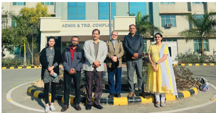
Interns at CDTI, Ghaziabad (UP)

3 Interns joined the BPR&D Paid Internship Programme in January 2023 for a period of 1 month and visited CDTI, Ghaziabad (UP), National Crime Records Bureau, New Delhi and Police Station, Vasant Kunj, New Delhi. A total of 13 Interns completed their Paid Internship Programme till February, 2023. ●