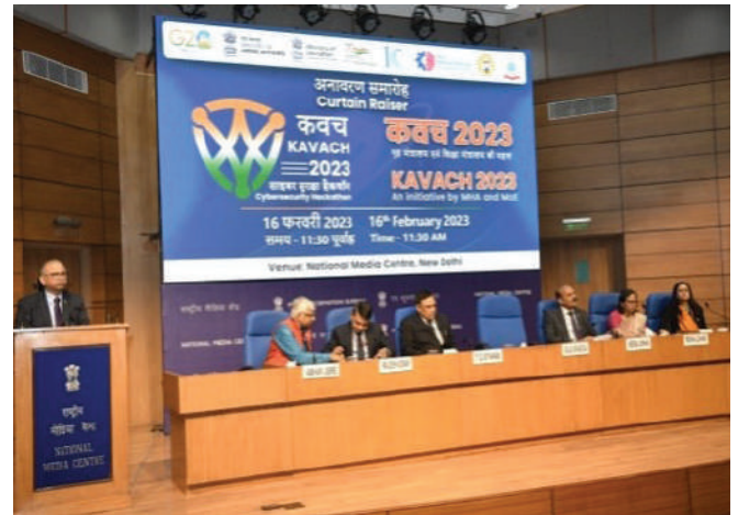
DG, BPR&D addressing the Media