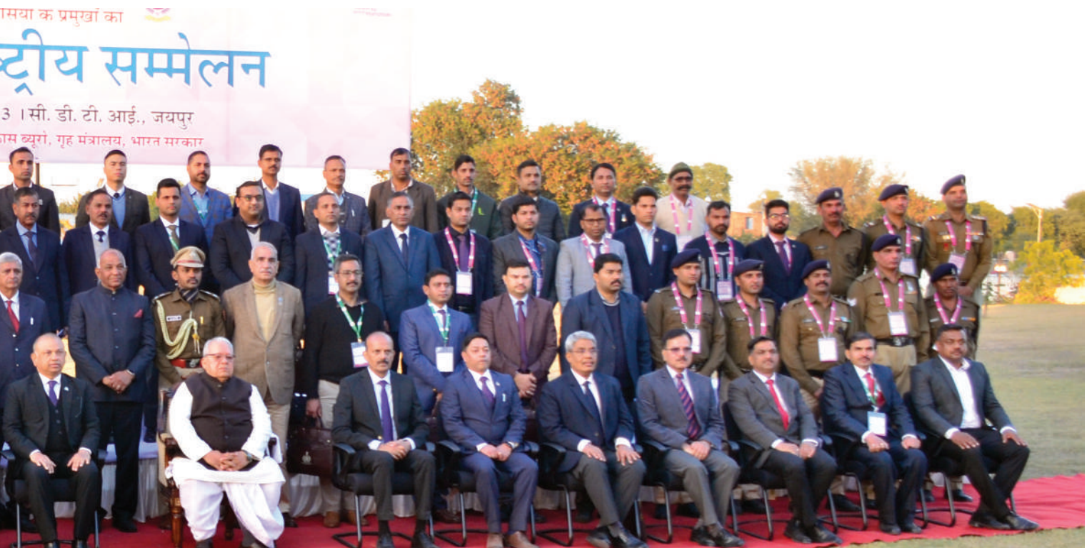
Group photograph of participants during 3rd National Conference of Heads of Police Investigation Agencies

05.01.2023 to 06.01.23, in which 37 Senior Officers from Various States /Organisations participated