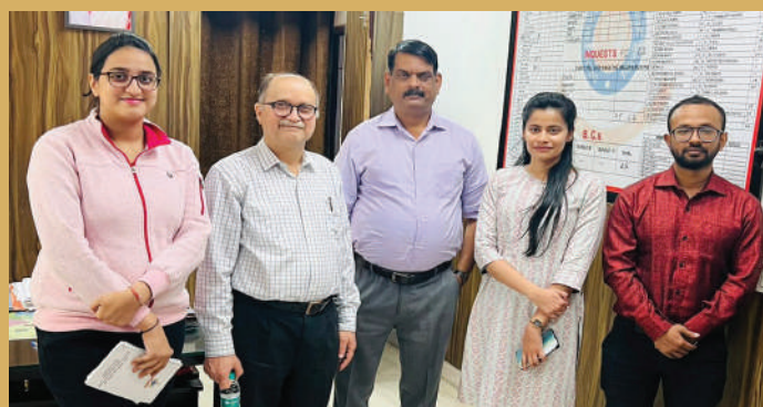
Interns at Police Station Vasant Kunj, New Delhi

On 14.02.2023, a virtual event titled 'Presentation/Demonstration by firms / vendors of their latest products and technologies relevant to internal security' was organised. Six renowned firms made their presentations, which were witnessed by 124 senior police officers from various States / UTs / and CAPFs. ●