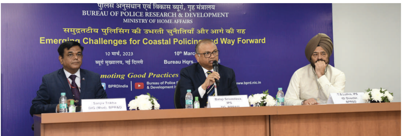
DG, BPR&D addressing the stakeholders

The Land, Sea Border Management and Coastal Security Vertical under Modernization Division had recently organized its maiden seminar on 'Emerging Challenges for Coastal Policing and Way Forward' on 10.03.2023. The seminar was attended by representatives from Ministry of Home Affairs, UT Division, Border Management Division, PM Division, National Maritime Security Coordinator, Intelligence Bureau, Indian Coast Guard, Border Security Force and all the Coastal States/UTs. A total of 11 presentations were delivered during the seminar followed by discussions. During the event, various issues concerning the revision of Standard Operating Procedures for Coastal Police Stations of India were discussed with all the stakeholders. ●