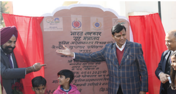
माननीय केन्द्रीय गृह राज्यमंत्री, श्री नित्यानंद राय जी सीडीटीआई, जयपुर कैम्पस में नए बाल उद्यान का उद्घाटन करते हुए