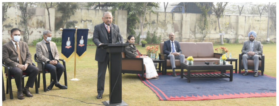
DG, BPR&D, addressing the Staff Sammelan

A Staff Sammelan was organized to celebrate the New Year, 2023 at BPR&D Head Quarters. DG, BPR&D addressed the gathering and set the agenda for the New Year. ●