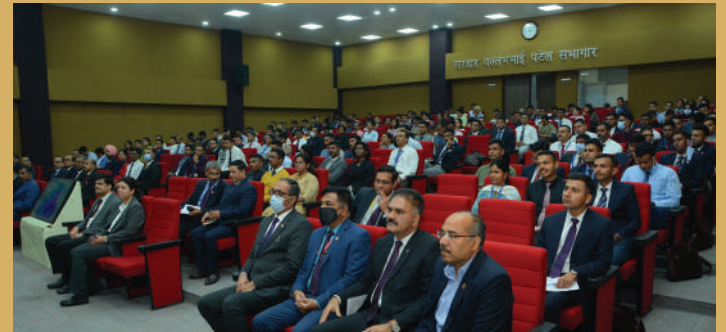
DG, BPR&D chaired attachment of 74 RR IPS Probationers (170 IPS Probationers) with BPR&D on 24.02.2023