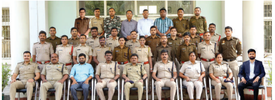
Director, CDTI, Hyderabad with course participants

Basic and intermediate course on "Cyber Crime Investigation and Digital Forensics" was organised at the National Cyber Research, Innovation and Capacity Building (NCRI&CB) Centre, CDTI, Hyderabad. 30 officers from various States/Union Territories/Central Armed Police Forces (CAPFs) participated. ●