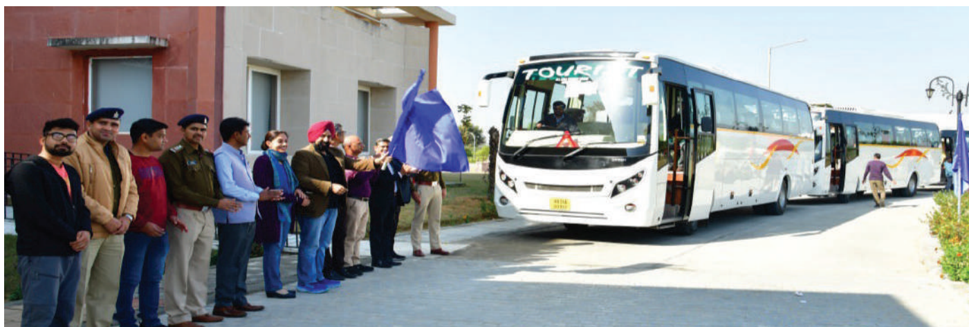
Director, CDTI, Jaipur, flagging off the buses for the visit at different tourist places of Jaipur