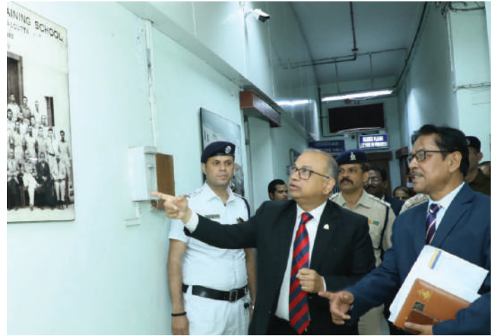
DG, BPR&D, visiting CDTI, Kolkata