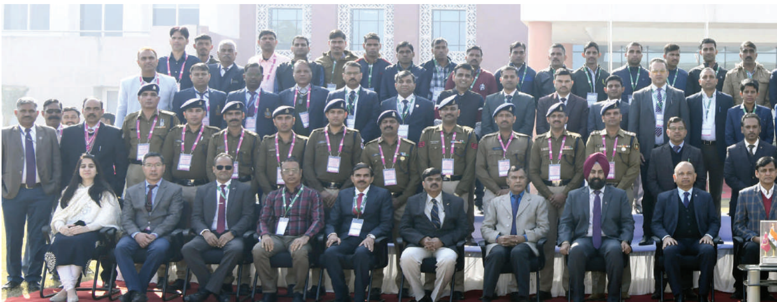
Group photograph with Hon'ble Union Minister of State (Home), Sh. Nityanand Rai, and other officials.