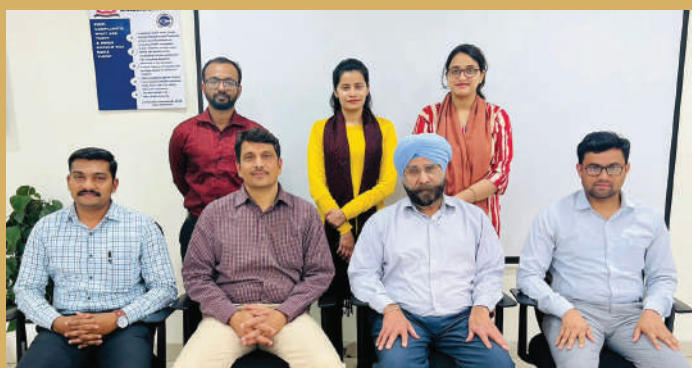
Interns at National Crime Records Bureau, New Delhi