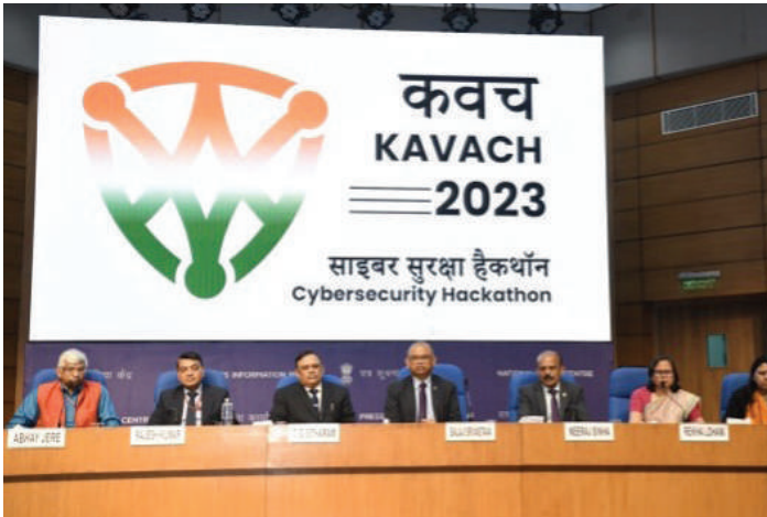
Launch of 'Kavach 2023' Hackathon

On 16.02.2023, BPR&D, I4C, Innovation Cell of Ministry of Education and AICTE jointly launched the National Level Cyber Security Hackathon 'KAVACH 2023', at National Media Centre, New Delhi. DG, BPR&D, Chairman, AICTE, ADG, BPR&D, Vice Chairman, AICTE, Director (Mod), BPR&D, attended the function. ●