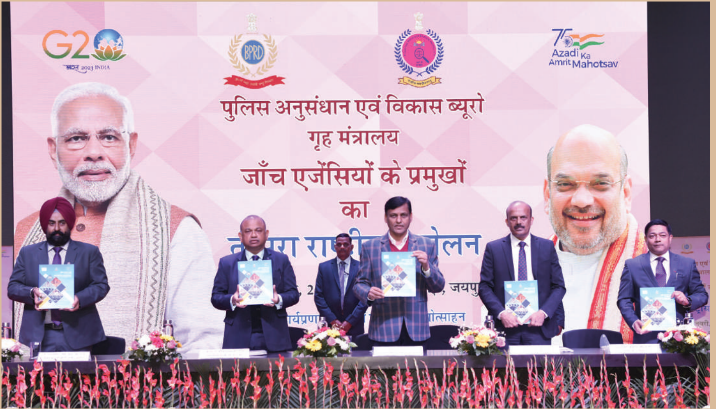
माननीय केन्द्रीय गृह राज्यमंत्री श्री नित्यानंद राय जी द्वारा जांच एजेंसियों के प्रमुखों के तीसरे राष्ट्रीय सम्मेलन में पुलिस संगठनों के आंकड़ों की पुस्तिका का विमोचन

Vol. IV :: Issue VII | January - March 2023